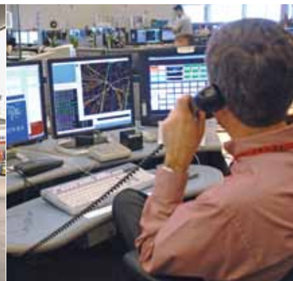
Current and potential employees should feel confident in knowing that American and American Eagle provide a safe, inclusive, and professional working environment – one that supports development, rewards achievement, and values diversity of thought.