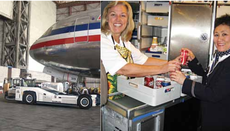
We are committed to identifying and implementing programs to reduce our environmental impact.

We act as good environmental stewards, implement innovative ideas, and make wise investments to minimize our environmental footprint.