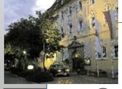
Best Western Premier Hotel Rebstock, Wurzburg, Germany