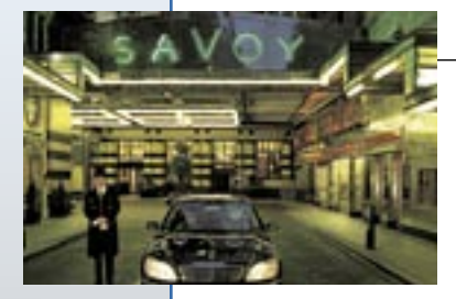
The Savoy, A Fairmont Hotel, London