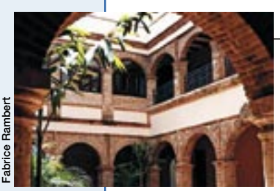
Sofitel Nicolas de Ovando, Santo Domingo, Dominican Republic