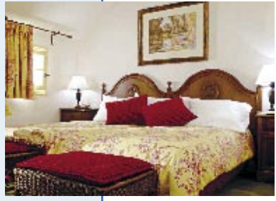
Marriott's Village d'Ile-de-France